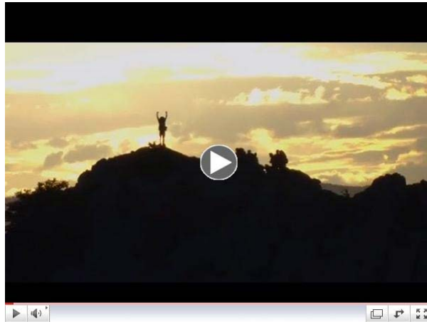
Philmont Scout Ranch Promo

Registration is now open for the Blue Ridge Council 2014 Philmont Trek!